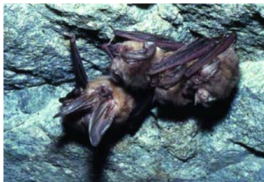
Townsend's big-eared bats roosting in a mine.

See more info about bats on our web site: www.easternsierralandtrust.org/Pages/OnWildSide.htm . ■