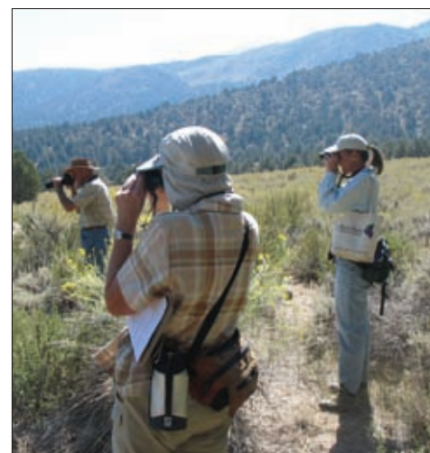
Spotting butterflies with binoculars, volunteers monitor the occurrence of a rare species. Migration corridors are important to all kinds of wildlife, including insects.