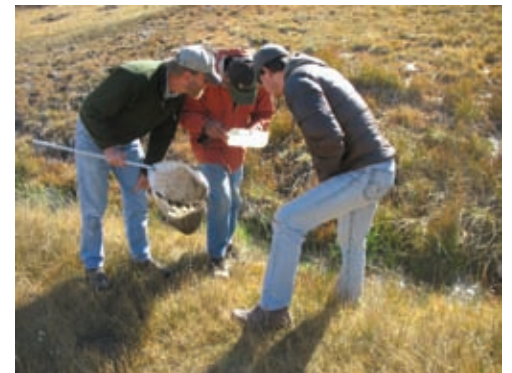
The populations of the native speckled dace fish have become small and isolated, making them vulnerable to extirpation. The United States Fish & Wildlife Service has partnered with ESLT to re-establish the species in the ponds at Benton Hot Springs Ranch.

This project, as is true for many of the most successful land conservation and restoration projects, has been made possible only through the collaboration