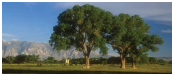
Responding to your requests, ESLT is now offering a tree-free membership. We can help you reduce the paper in your life by sending you renewal requests and our SierraScapes newsletter online.

Do you enjoy your ESLT membership, but wish you could avoid some of the paper associated with it? Consider switching to our tree-free membership option! This will save paper and costs involved in our membership renewal, newsletters and other mailings