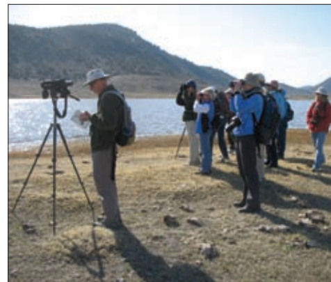
Despite chilly temperatures this spring, visitors to Black Lake, a rare desert wetlands located in remote Adobe Valley, saw many beautiful birds including American Avocets, Cinnamon Teals, and Longbilled Dowitchers.