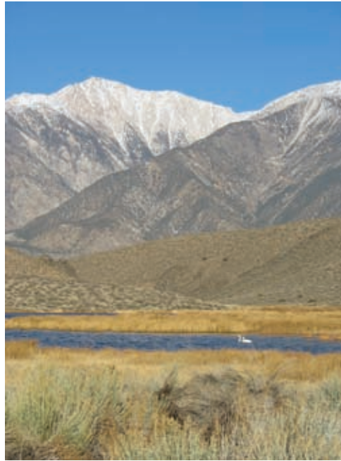
Research of previous field survey records dating back to the 1930's revealed that Benton Hot Springs Ranch once hosted a population of the native speckled dace fish.

This project represents an important collaboration by a variety of organizations and agencies. The easement purchase was funded by the California Resources Agency and also benefitted from a Defenders of Wildlife Living