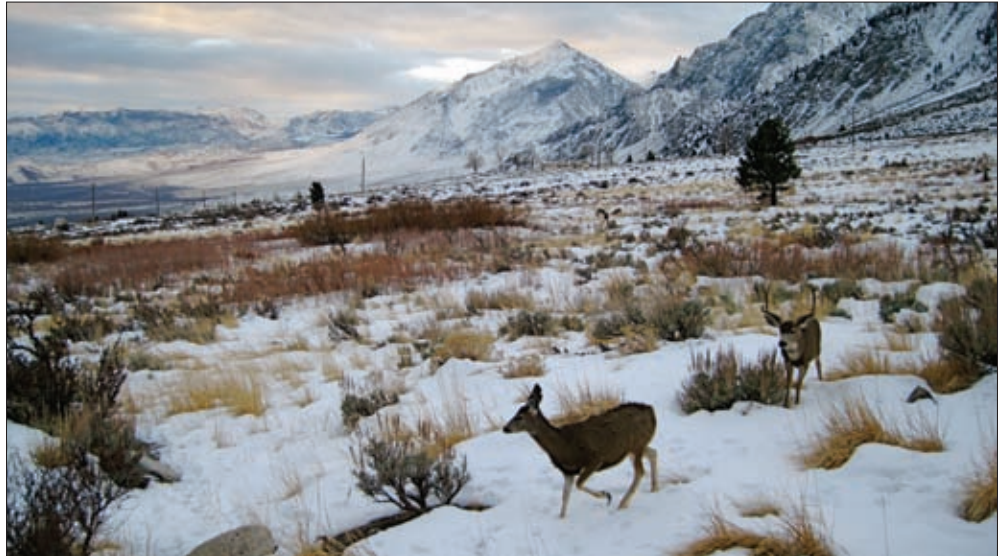
Round Valley mule deer browse for winter forage on an ESLT Conservation Easement in Swall Meadows. Protecting mule deer and other wildlife were the impetus that inspired the founding members to start a local land trust.