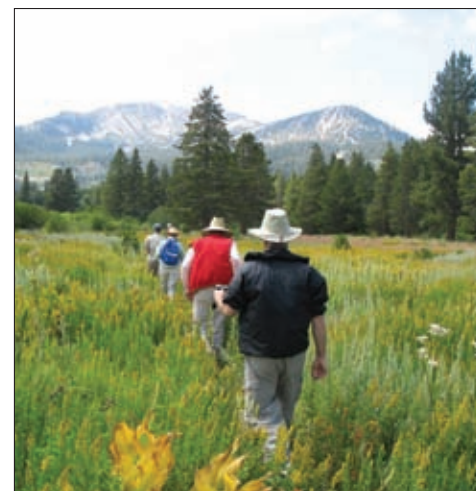
In a sea of colorful goldenrod in Snowcreek Meadow, workshop participants enjoyed learning to find their way using their GPS units with Mammoth Mountain in the background.