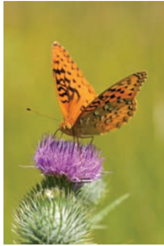
A vibrant male Apache Silverspot lands on a flowering bull thistle to nectar. Habitat for sensitive species like this butterfly are preserved through the work of ESLT.

The Apache Silverspot nectars on bright purple thistle flowers found in moist meadows, seeps, and marshes. While drawn to these flowers for nourishment, they are attracted to Viola nephrophylla , the Northern Bog Violet, to lay their eggs. These low lying viola plants that grow in riparian areas have leaves that provide a protected shelter under which eggs can develop without disturbance from predators. Due to the close ecological relationship between its host plant and its nectar source, the Apache Silverspot has specific habitat needs and is quite vulnerable to impacts. Thus, the Apache Silverspot populations are scattered and uncommon. Keep your eyes open for these bright bursts of color on your next East Side adventure! ■ By Sarah Spano, ESLT AmeriCorps member