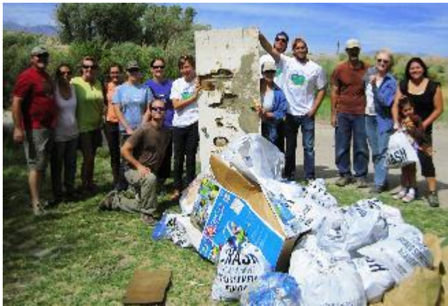
Image 2 Caption: Come together with the community on Saturday, September 10 to help remove trash and debris from the Owens River.